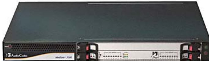
Figure 1: Mediant™ 2000 VoIP Gateway